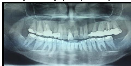
Fig 1: Diagnostic preoperative OPG revealed hopeless tooth No.8.

For both groups treatment began for both groups with local anesthesia xylocaine/adrenaline 2% which was induced by block or infiltration technique. After elevation of mucoperiosteal flap, all implants were inserted according to a strict protocol that followed the manufacturer's instructions. For group B, immediate extraction of hopeless teeth/retained roots was performed as atraumatically as possible prior to implant installation, (Fig 2). Sutures were removed 10 days after surgery. For both groups, 150 implants (Dentium, Korea) were installed. With 100 implants for group A and 50 for group B. The actual ISQ (implant stability quotient) were collected for both groups with the aid of RFA (resonance frequency analysis) using Osstell device (Goteborg, Sweden) with maximum insertion torque values of 35 N/cm during low speed insertion by means of a transducer attached to implant body (smart peg) and readings for the primary stability were scored, Fig 4. ISQ values were considered as follows: low (0-50), medium (51-70) and high (71-100). Patients instructed to take the following drug regimen: Amoxicillin 500 mg + metronidazole 250 mg + Paracetamol 500 mg /thrice daily for 5 days postoperatively.