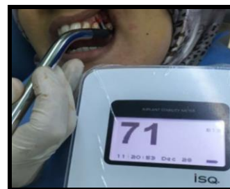
Fig 4: ISQ primary stability measurement for tooth site No. 12 with the aid of Osstell device.

In a correlation to the implant length for group A: the highest stability recorded with the length (14 mm) 73.78 ISQ and the lowest with (8 mm) 67.70 ISQ. While; for group B, the highest figure 81 ISQ was with (10 mm, insignificant) since single fixture is inserted. The lowest reported with (14 mm), however, most fixtures fall under the category of this length (31 dental implants) with 63.85 ISQ as shown in table 5.