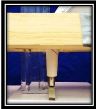
Fig. 4: The tip of VITA Easyshade Compact was perpendicular and in contact with archwires surface

spectrophotometer VITA Easyshade Compact was adjusted and calibrated according to the manufacturer's instructions and it was held by a special holder and kept the tip of it perpendicular and in contact with archwires surface using ruler as a guide (Fig. 4) (5,11) .