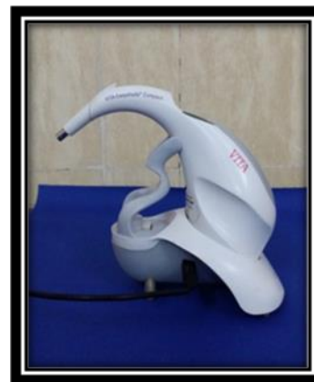
Fig. 3: Spectrophotometer VITA Easyshade Compact

The color measurement of each sample was performed by using a spectrophotometer VITA Easyshade Compact (VITA Zahnfabrik, Bad Sackingen, Germany) (Fig. 3).