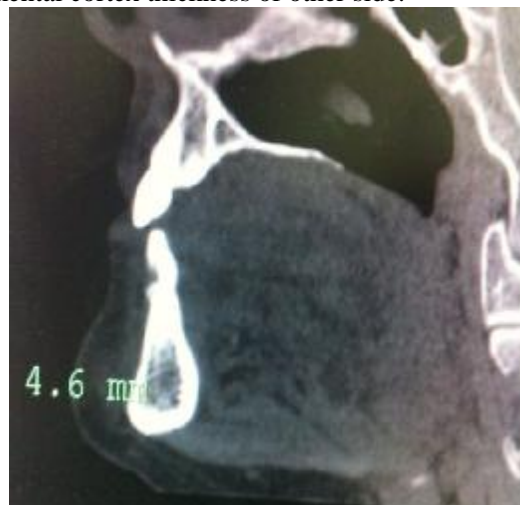
Figure 1: Mental cortical thickness

Scrolling the mouse to get opposite side and same technique was repeated to measure the mental cortex thickness of other side.