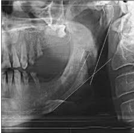
Figure 2: Gonial angle