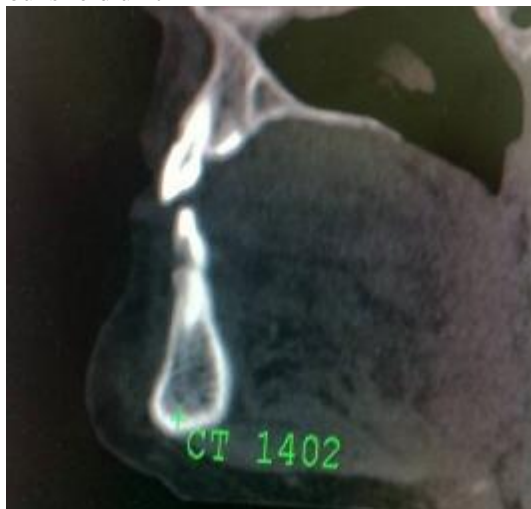
Figure 3: Bone density in mental area in HU

BMD were recorded in the mental and gonial areas at full thickness of the cortical bone in Hounsfield unit