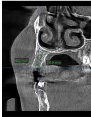
Figure 1: The CBCT cross section view with bone dimensions measurement.

All the procedures were performed under local anesthesia lidocaine hydrochloride 2% with epinephrine (1:80,000). A mucoperiosteal flap was reflected and the implant site preparation proceeded using osteotomy drills of increasing diameter corresponding to the implant dimensions with an implant micromotor (Dental surgery micromotor iCT, Dentium, Korea) rotating at a speed of 800 rpm with copious saline irrigation. The implants (Superline, Dentium, Seoul, Korea) were installed into the osteotomy site using the motorized method with the engine set at 50 rpm and 35 Ncm torque, so that the implant platform is 0.5-1 mm below the bone level. When the implant could not be inserted to the requisite depth by the motorized method, a hand ratchet was used and the IT was recorded as > 35 Ncm. Accordingly, in this study, implants were categorized into two groups regarding the IT; one group with 35 Ncm insertion torque and the other > 35 Ncm. Immediately after insertion of DI, the primary stability was measured using Osstell®ISQ (Osstell®, Gothenburg, Sweden). Two repeated measurements were obtained for each implant along the buccolingual and mesiodistal axis and the mean of these two readings was taken (Fig. 2).